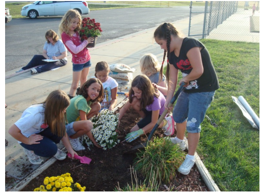
Girl Scout Troup #40852

No RSVP necessary. We hope to see you there!